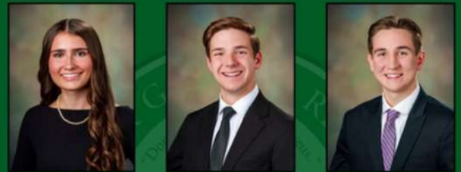
Father Gabriel Richard High School Top Scholars Class of 2025 Huron Valley Catholic School Class of 2021